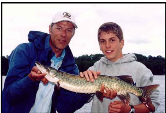
Happy client with first muskie.