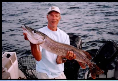
Incidental pike catches are common